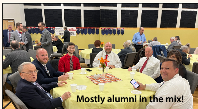
Mostly alumni in the mix!